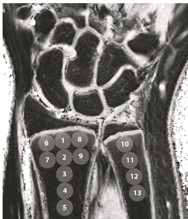
Fig. 1 Placement of regions of interest on post-processed coronal T1-weighted and T2-weighted Dixon images. ROIs 1, 6, 8, and 10 were placed directly adjacent to the physis, representing most distal 0–5 mm of the metaphysis

The primary outcome measure was distribution and magnitude of metaphyseal water signal fraction in the radius and ulna. Two musculoskeletal radiology research physicians independently measured metaphyseal water signal fraction on three slices showing the radial maximal width and on the slice showing the ulnar maximal width. Thirteen regions of interest (ROIs) with a 5-mm diameter were drawn using ImageJ (v1.50i, US National Institutes of Health, https://imagej.nih.gov/ij/ ) (Fig. 1). ROIs ranged from the epimetaphysis 0–5 mm proximal to the physis, to the metadiaphysis 20–25 mm proximal to the physis in order to evaluate metaphyseal water signal fraction distribution. After 20 training measurements, both raters performed measurements in 25 participants independently on T1-weighted and T2-weighted images and interrater agreement was determined. In case of good interrater reliability (intraclass correlation coefficient \geq 0.75 ), one rater performed measurements in all participants for further analysis.