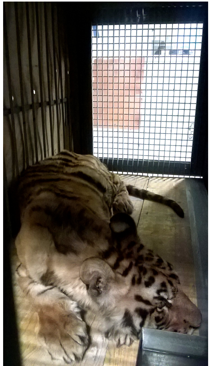
Figure 1 Attainment of sternal recumbency in one tiger.

All tigers were initially administered with a combination of DEX hydrochloride (HCl) (Dexdomitor 0.5 mg/ml; Vetoquinol Italia, Italy) at 10 \mu g/kg and KET hydrochloride (HCl) (Ketavet 100 mg/ml; MSD Animal Health Srl, Italy) at 2 mg/kg, given by remote intramuscular injection into the hindquarter muscles through two consecutive blowpipe darts. The total volume of DEX and KET was calculated for each animal and mixed together in a single syringe. Then, the volume was equally divided into