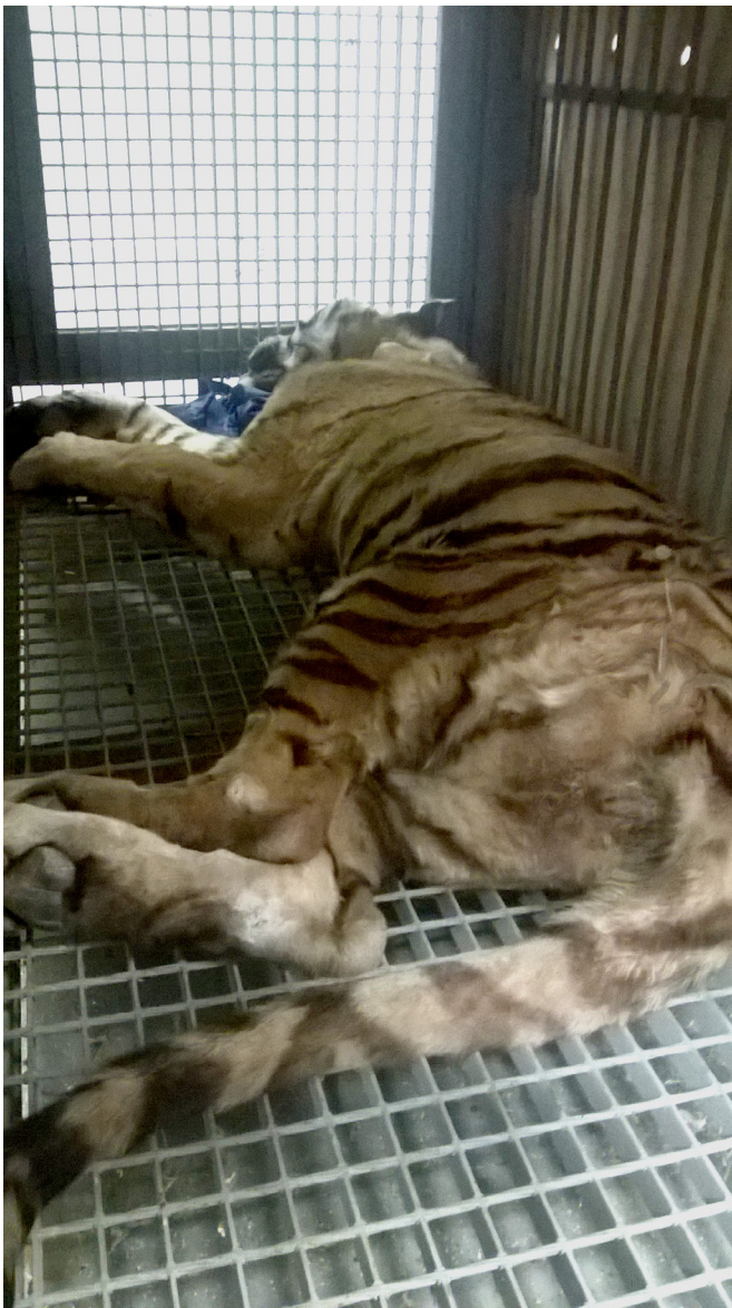
Figure 2 Attainment of lateral recumbency in one tiger.

procedures, the original immobilisation protocol was varied as follows: (A) Tigers scheduled for diagnostic procedures requiring general anaesthesia were additionally administered with intravenous titrate-to-effect propofol (Propofur; Boehringer Ingelheim Animal Health, Italy) to achieve orotracheal intubation and maintained with isoflurane (Isoflo; Zoetis, Italy) in 100 per cent oxygen. These animals were also administered with an intramuscular injection of butorphanol (Dolorex; MSD Animal Health, Italy) at 0.1 mg/kg on intubation. (B) Tigers showing no signs of sedation after 15 minutes post darting (ie, permanence of standing position and full responsiveness to environmental stimuli) were readministered with 10 µg/kg of DEX and 2 mg/kg of KET by remote intramuscular injection. (C) Tigers attaining lateral recumbency but showing ear twitch reflex were administered with intravenous titrate-to-effect propofol in order to abolish the reflex and ensure deeper sedation.