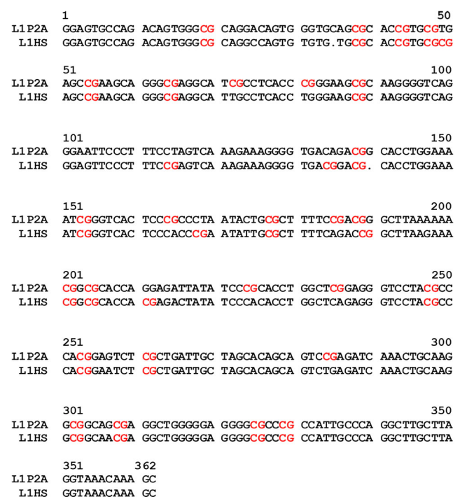
Fig. 1 Sequence alignment of CpG islands of the L1PA2 and L1HS subfamilies. The positions of each CpG site are indicated in red. The L1PA2 and L1HS subfamily contain 27 and 25 CpG sites, respectively

We next examined the methylation level at individual LINE-1 CpG sites in cfDNA. The methylation level varied