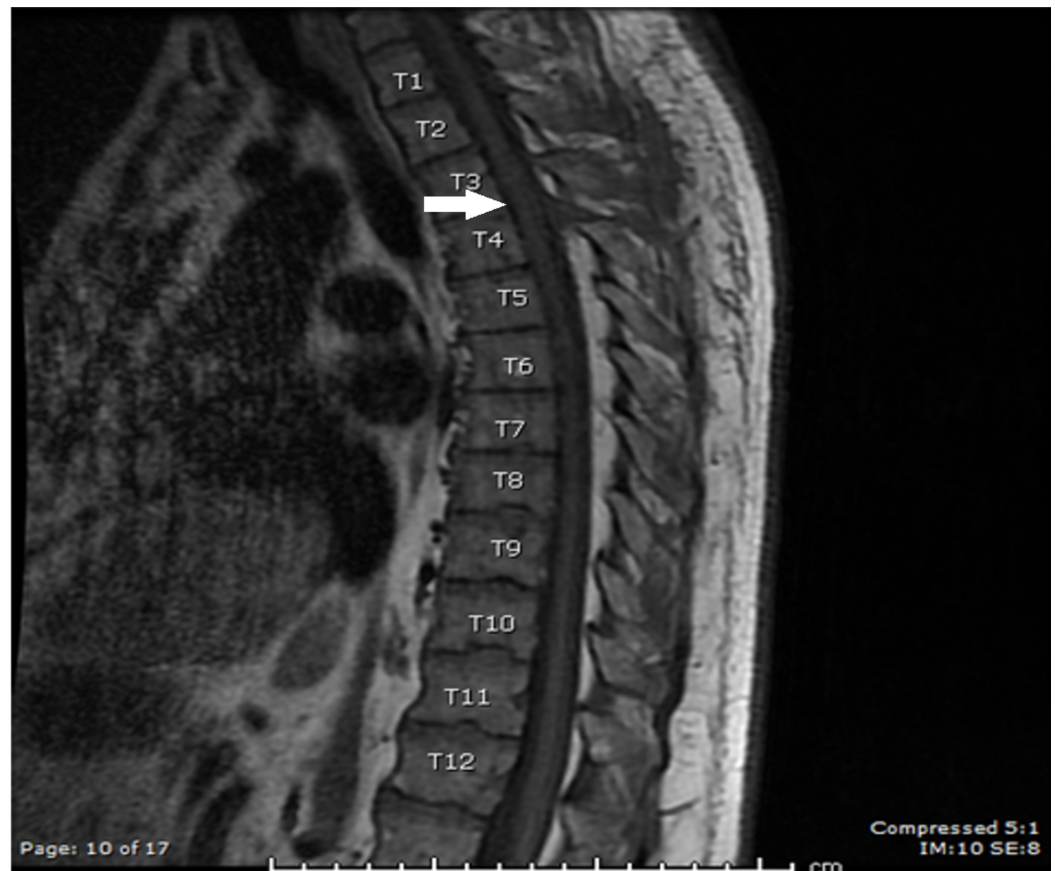
FIGURE 3: Postoperative T1 sagittal MRI with contrast

during the procedure and no changes were seen on neuromonitoring. Postoperative scans demonstrated no residual lesion (Figure 3). The patient was relieved of his mid-back or thoracic radiculopathy and remained neurologically at baseline immediately post-operatively and at six months.