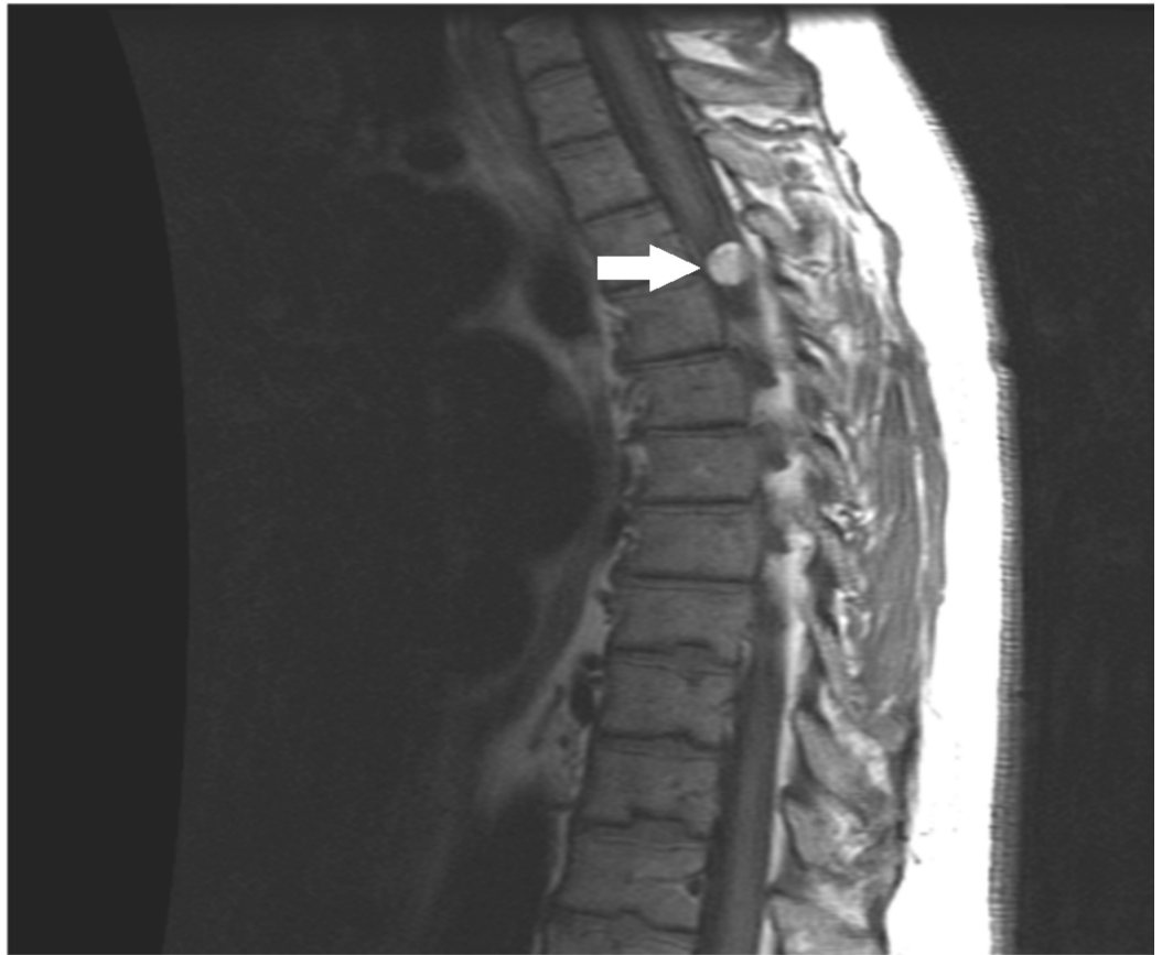
FIGURE 1: Preoperative T1 sagittal MRI showing a hyperintense lesion at the T3-T4 level