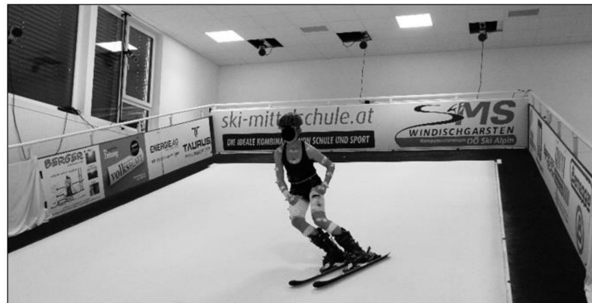
Figure 1. Illustration of the experiment configuration in the indoor skiing carpet.