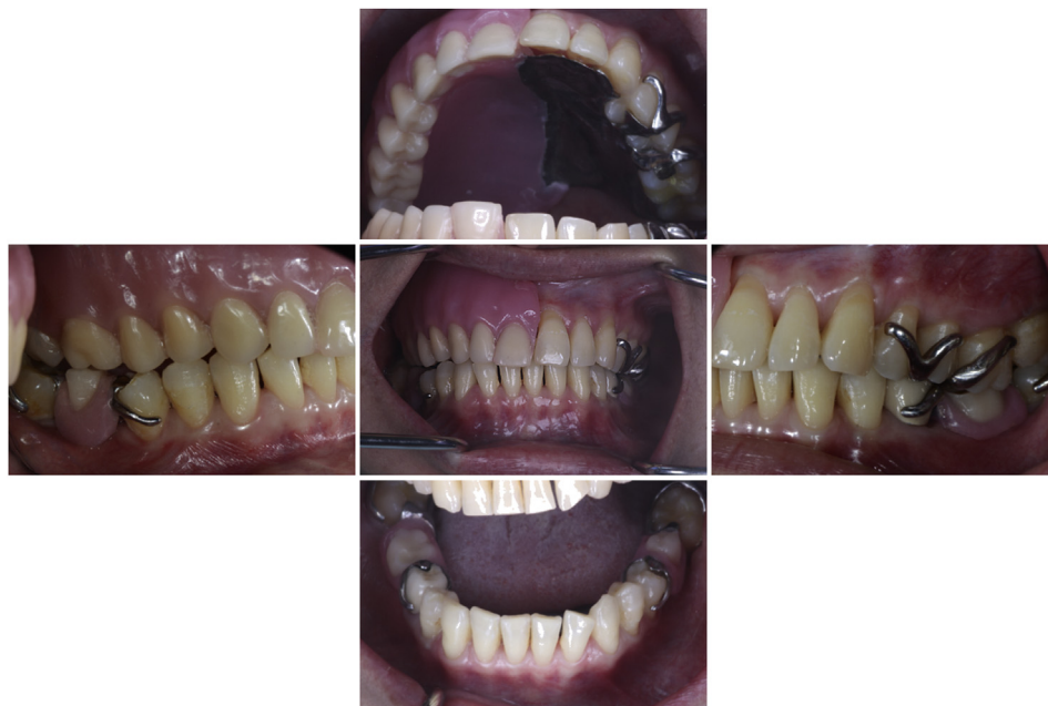
Figure 5: Post-treatment clinical photographs.

they were provided successfully to maintain the patient's dignity and wishes.