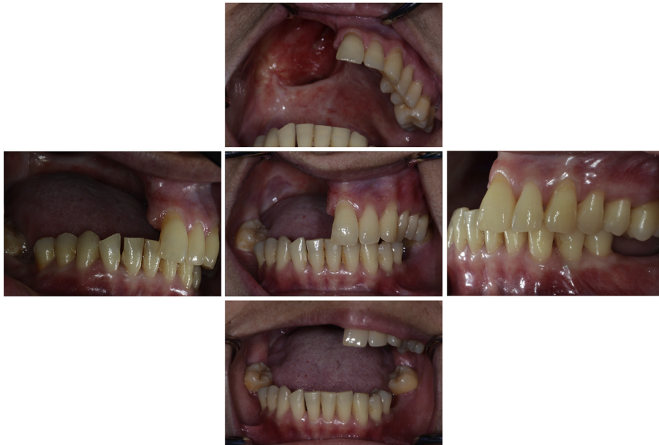
Figure 2: Pre-treatment clinical photographs.

upper right maxillary sinus and a few lower missing teeth (Figure 2). It showed that the patient had adequate oral hygiene, but some calculus accumulations. The patient had a challenging limited mouth opening (12 mm) as a consequence of radiotherapy (Figure 3A). She reported brushing her teeth twice daily using a high fluoride-containing toothpaste.