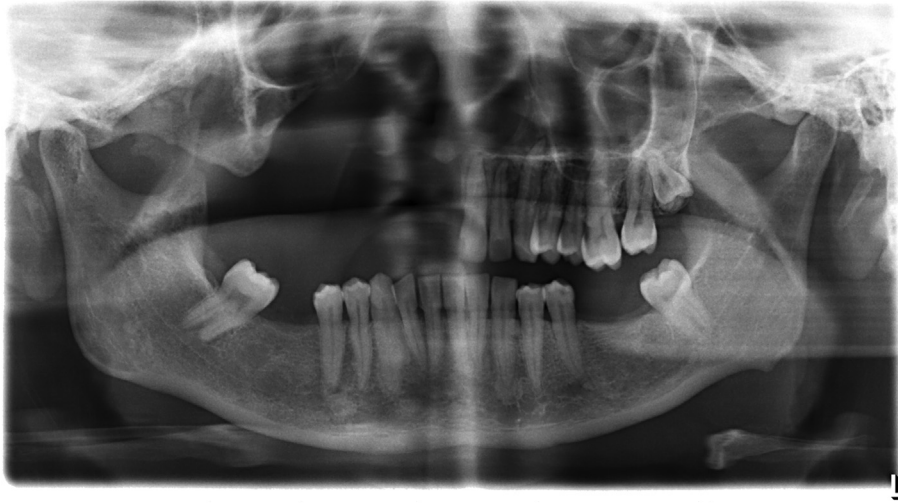
Figure 1: A dental panoramic tomograph (DPT).