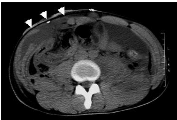
Figure 3. CT scan on the seventh postoperative day showing abscess formation with intramuscular spread in the abdominal wall (arrows).

disrupted abdominal wall musculature and fascia, without skin penetration and without preexisting hernia at the site, following blunt trauma. 5,6 TAWH is thought to be caused by shear stress associated with acute elevation of intraabdominal pressure. The shear stress is transferred to the peritoneum, fascia