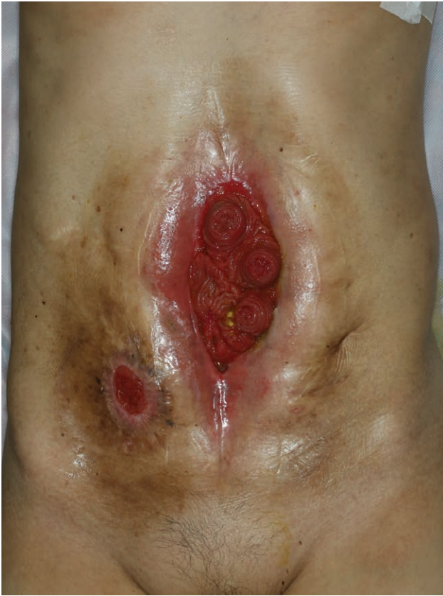
Fig. 1. Enterocutaneous fistula along the midline of the abdominal wall and a stoma in the lower right abdomen.