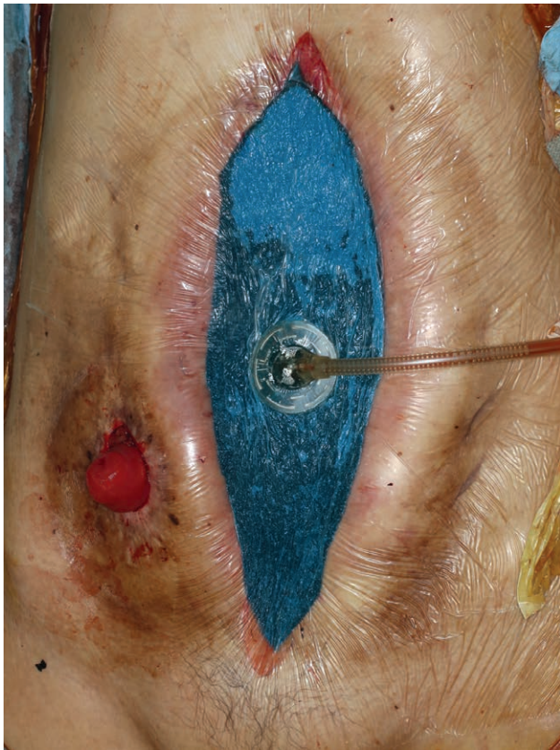
Fig. 3. Dressing drape and foam covering the abdominal cavity.