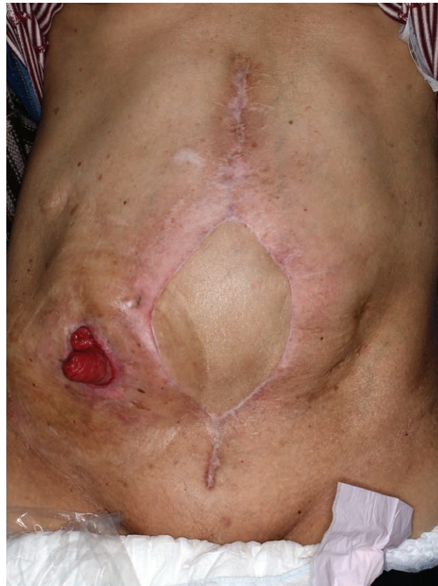
Fig. 4. Abdomen at 7 months postoperative.

dressing changes can be achieved in a time-saving manner independent of the surgeon's experience and skill. 8