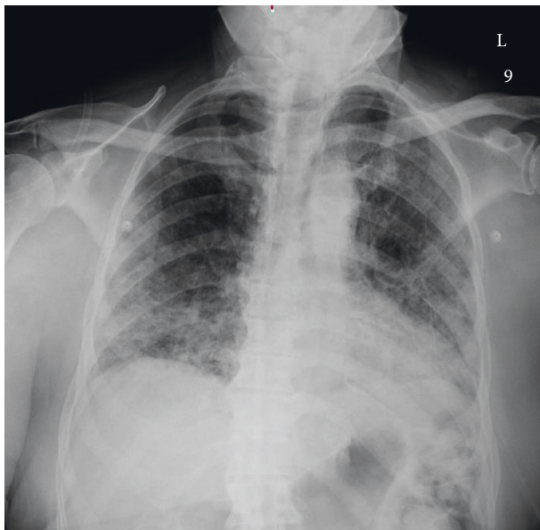
FIGURE 1: Chest X-ray anteroposterior on admission: moderately extensive bilateral patchy airspace disease.

The fasciotomy extended to the entire volar forearm and half of the dorsal forearm and across the volar wrist and on the dorsum of the hand.