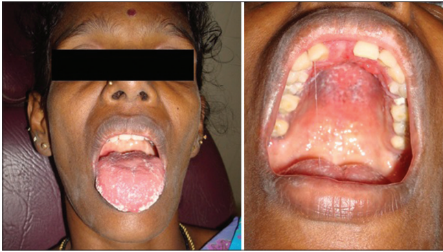
Figure 3: Pseudomembranous candidiasis involving tongue and palate

candidiasis, while the lesion on the palate was diagnosed as chronic multifocal candidiasis. The lesion on the gingiva was diagnosed as linear gingival erythema. The intraoral findings were consistent with the oral manifestation of AIDS, which raised our suspicion of the possibility of HIV infection.