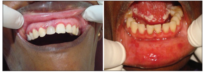
Figure 4: Linear gingival erythema

Oral manifestations are often the earliest signs of HIV infection and because of the ease of examination of the oral cavity; they serve as ideal indicators for not only diagnosing HIV but also aid in predicting the progression of the infection. Studies have shown that 90% of all individuals with AIDS will manifest with at least one oral lesion during the course of the infection. [3,4]