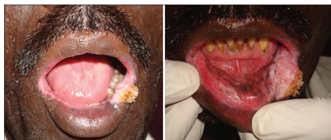
Figure 1: Exophytic growth on the lower lip and labial mucosa

Exfoliative cytology revealed PAS-positive hyphae admixed with exfoliated epithelial cells suggestive of candida hyphae. The patient was advised routine blood investigation along