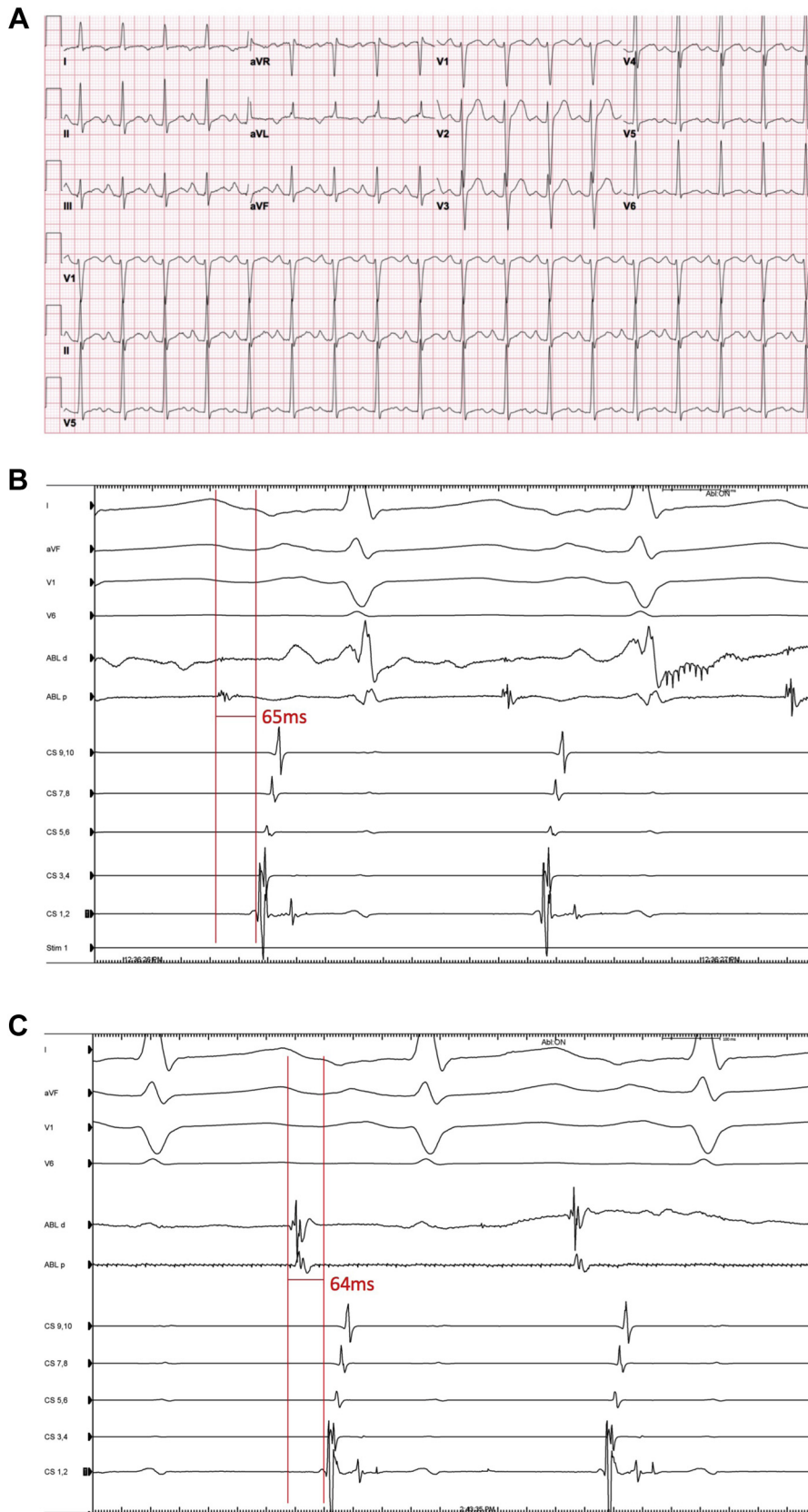
Figure 1 A: Twelve-lead surface electrocardiogram of atrial tachycardia with P waves negative in leads I and aVL, positive and bifid in inferior leads and lead V 1 , consistent with a left atrial tachycardia. B: Earliest epicardial activation with ablation signal -65 ms preceding surface P wave. C: Earliest endocardial activation with ablation signal -64 ms preceding surface P wave. Ablation at this site with power of 50 W was successful in terminating tachycardia.