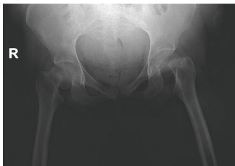
FIGURE 1: Preoperative anterior-posterior radiographs of the pelvis demonstrating the displaced bilateral femoral neck fractures.

At presentation in our department, the clinical examination showed massively reduced hip movement on both sides because of severe pain. Serum laboratory examination was normal.