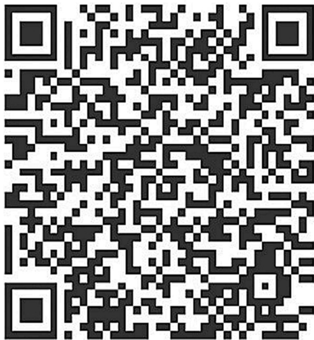
Figure 2 Application for the new mode of mobile internet-based home nursing service.

subcutaneous injection (n=32, 6.15%), general stoma care (n=10, 1.92%), psychological care (n=7, 1.35%), and intramuscular injection (n=2, 0.38%). The constituent ratios of the six major reasons to use the new mode of mobile internet-based home nursing service were 61.35%, 28.85%, 6.15%, 1.92%, 1.35%, and 0.38%, respectively (see table 2).