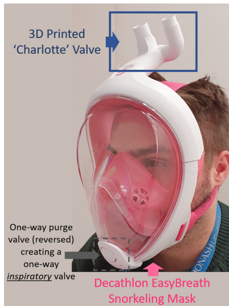
Figure 1 Decathlon Easybreath Adult Surface Snorkeling mask with additively manufactured modified valve.

Moreover, the application of a positive end-expiratory pressure (PEEP) valve to the expiratory line did not alter the performance of either mask, nor did the level of PEEP (range: 5–20 cmH 2 O) systematically affect the F I O 2 or degree of rebreathing (Fig. S6 in Supplementary Information). However, high levels of PEEP (15–20 cmH 2 O) delivered to the Snorkel mask caused