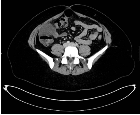
Figure 1: Axial CT demonstrating mass anterior to ascending colon with surrounding inflammatory changes.