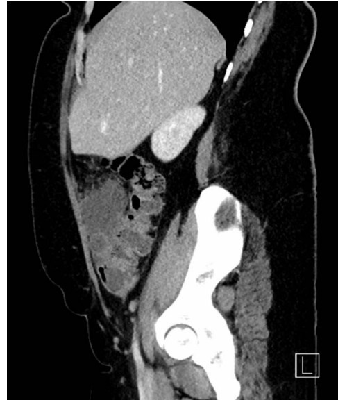
Figure 3: Sagittal CT reconstruction highlighting location of mass anterior to ascending colon.