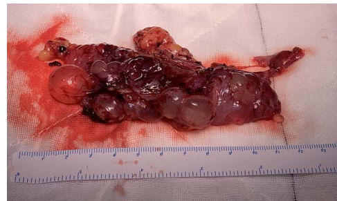
Figure 4: MCPM specimen.

colon measuring 43 \times 55 \times 54 mm (Figs 1–3). This mass appeared separate to the ovary and the appendix.