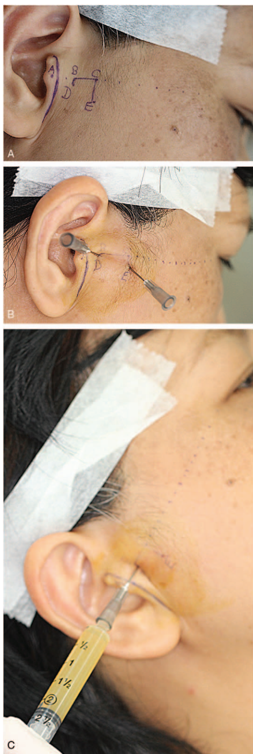
Figure 1. (A) Landmarks in surgical intervention approaches. (B) Double needle technique. The position where the needle was injected was within the superior joint space. (C) Injected 2 mL of liquid phase concentrated growth factors along the No. 22 void needle at point D.

made during a follow-up visit for patients every month (return visits were shifted to an earlier time if there were changes in symptoms); at the stage of LPCGF injection, records were made in the first week, and then once per month until the 6th month