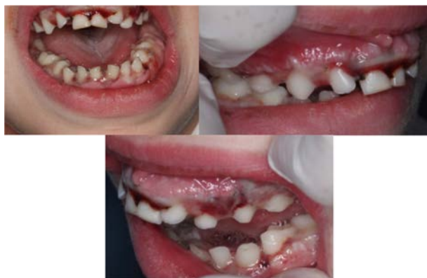
Figure 6. Buccal, left and right intra-orally views one-week post-operative.