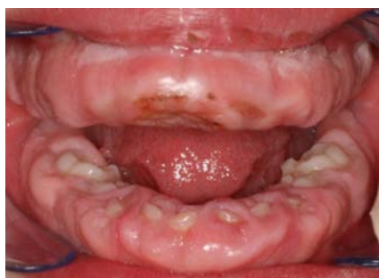
Figure 1. Intraoral view showing the severity of gingival hyperplasia in a 6-year old patient with hereditary gingival fibromatosis.

The optimal course of treatment for HGF is