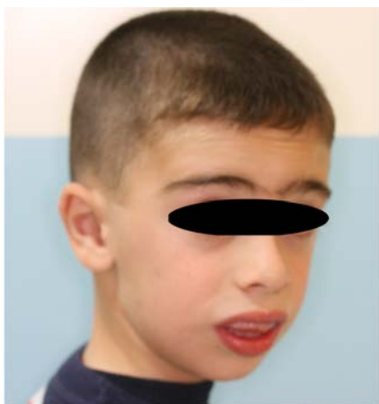
Figure 2. Extraoral view showing bushy eyebrows, maxillary protrusion and lips incompetence.