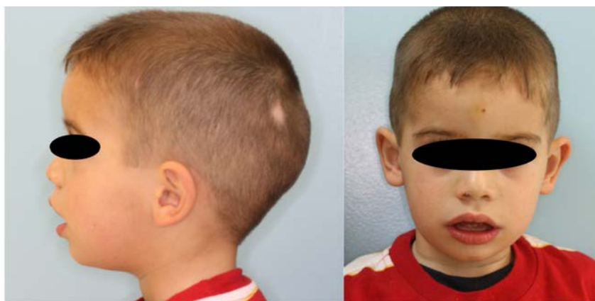
Figure 4. The patient's brother presenting similar extra-oral features.