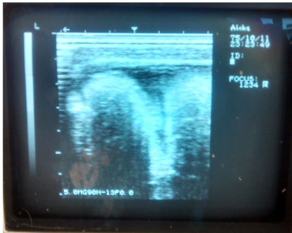
Fig. 2 Photograph illustrating an ultrasonography demonstrating the presence of intestinal loops in the subcutaneous region in the left ventral-lateral region of the abdomen of a horse with traumatic eventration