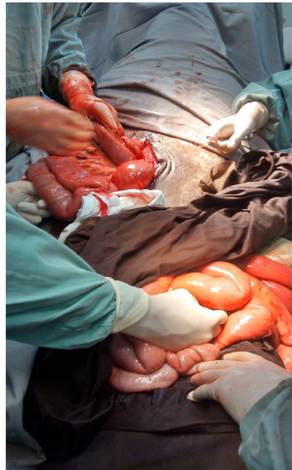
Fig. 3 Photograph illustrating a horse undergoing surgery for treatment of traumatic eventration, showing the passage of intestinal loops through lacerations of the abdominal muscles on the left ventral-abdominal region, and incision through the retro-umbilical region for traction and repositioning of eventrated tissues

After the repositioning of the intestinal loops, the peritoneum was closed in both openings of the abdominal region, using chromed catgut-4 suture line in a simple