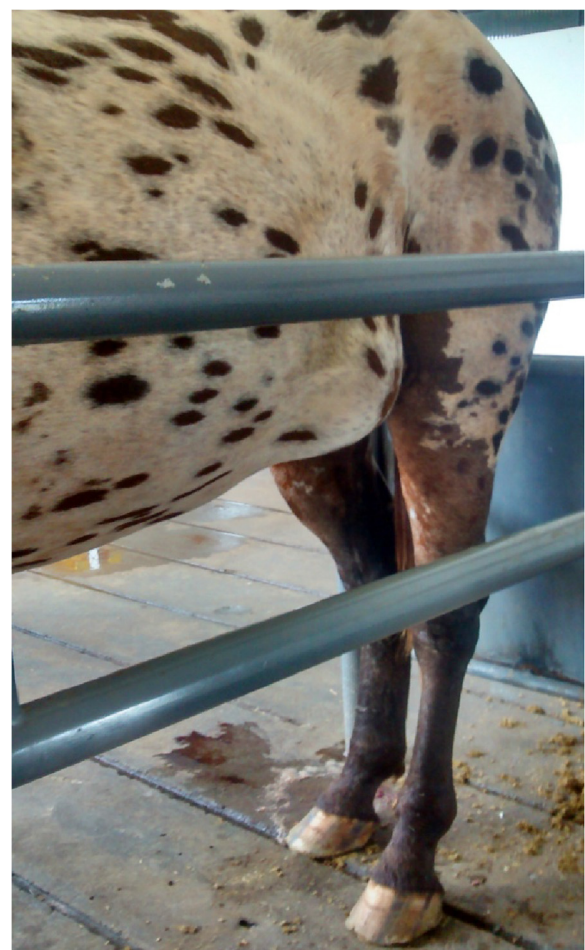
Fig. 1 Photograph demonstrating the equine presenting increased volume on the left ventral-lateral region due to trauma

Pre surgical preparation comprised of 8-h fasting of water and 12-h fasting for solids. Anesthesia was performed with xylazine 10 % (1 mg/kg, IV), ketamine (2 mg/kg, IV), and guaicolglyceryl ether (50 g), diluted in 0.9 % saline solution (500 ml), all administered IV as pre anesthetic medication and also for induction of general anesthesia. After oro-tracheal intubation anesthesia