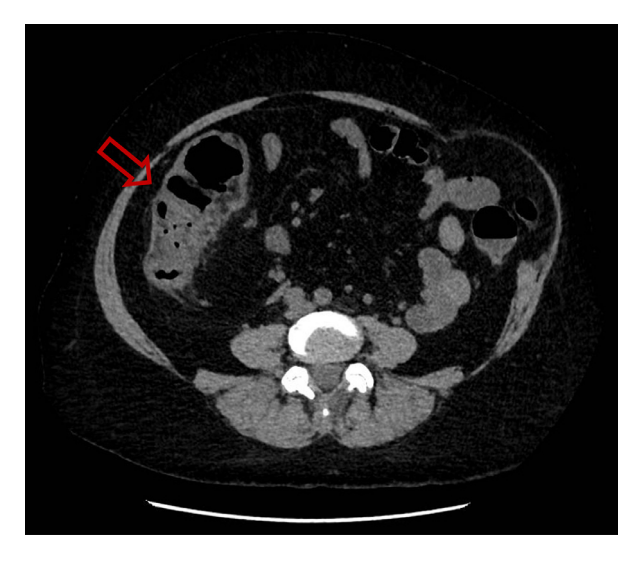
Fig. 1 – Non-injected abdominopelvic scan. Right ileocolitis, thickened appearance of the ascending colon with densification of pericolic fat.

She was hospitalized for the first time because of febrile aqueous diarrhea evolving for 72 hours. A non-injected abdominopelvic computed tomography (CT) scan showed right ileocolitis (Fig. 1). First-line investigations included stool culture, parasitological examination of stools that were negative, a blood culture pair before antibiotic therapy that returned sterile, and a negative viral load for cytomegalovirus (CMV). Then, antibiotic treatment was started with 1 g of