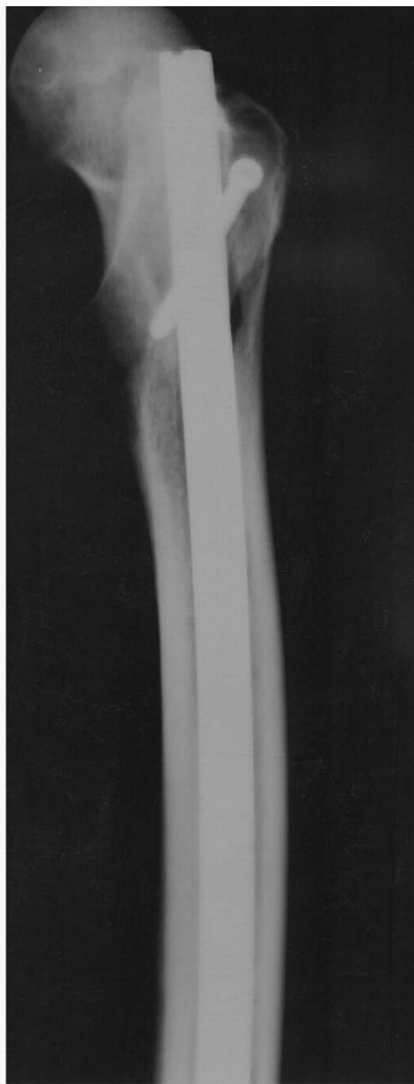
Figure 5 Lateral radiograph of the same femur. No evidence of fracture line can be documented.

copy is the preferable means of monitoring IMN intraoperatively. However, C-arm images often do not reveal subtle fractures that plain radiographs might, as the quality of the images using C-arm fluoroscopy is usually worse than that of plain radiographs [10].