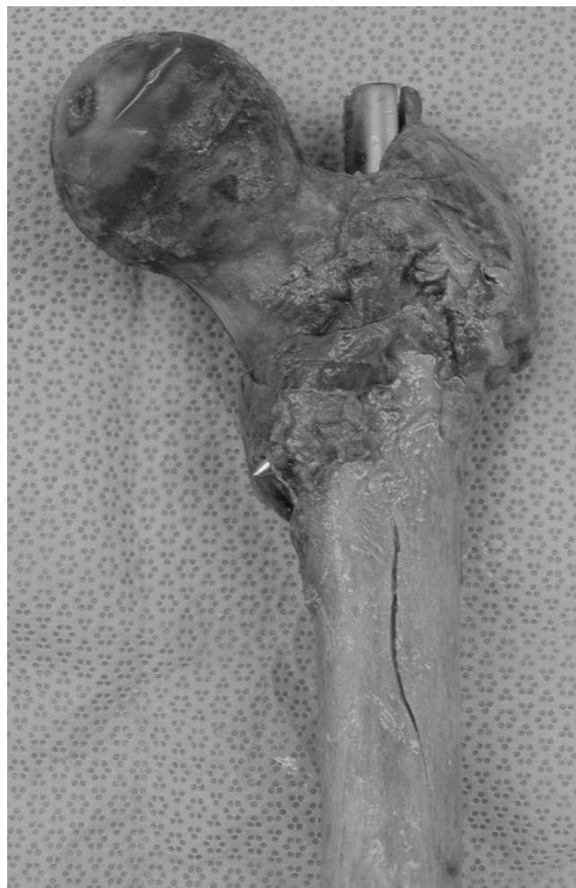
Figure 2 It is evident the longitudinal splitting in the anterior cortex of a femur.

No other fractures were found during inspection or radiographic control either in the first or in the second group. The radiographic and fluoroscopic control in the five frac-