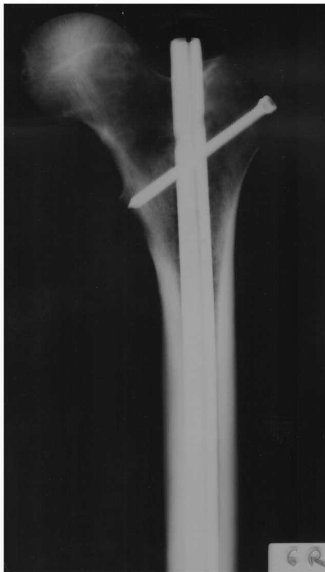
Figure 4 Anteroposterior radiograph of the same femur. No evidence of fracture line can be documented.

The placement of the nail more anteriorly to the posterior third of the neck in this study was complicated with a prevalence of 56% of anterior femoral splitting. All of these lesions were seen during nail insertion, at its final phase. A possible explanation could be that during reaming the flexible shaft of the reamers could easily follow the curved path of the medullary canal, as the femur is convex anteriorly. On the other hand, during nail insertion the relevant stiffness of the nail, the mismatch in curvature between the inserted nail and the medullary canal, in combination with an entry point anterior to the trochanteric fossa has possibly led to the femoral splitting. As described in an article by Egol et al [9], the average femoral anterior radius of curvature is 120 cm (SD \pm 36) and there is a significant mismatch between the anatomical radius of curvature of the femur and most intramedullary