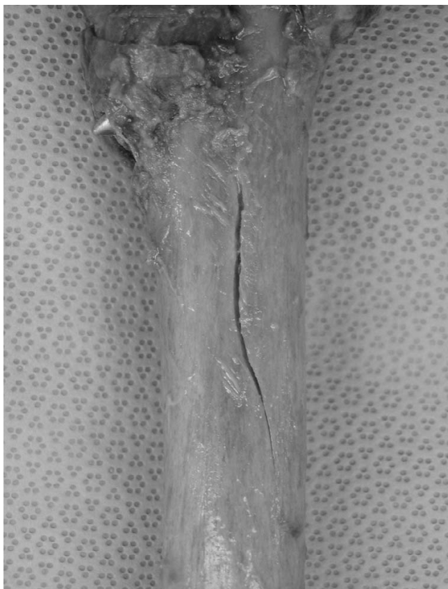
Figure 3 Close-up photo of the splitting in the same femur.

in consistent cracking of the proximal femur. Alho et al [8] also reported a 26% prevalence of proximal fragment comminution with an anterior insertion of the intramedullary nail. However, none of these studies used radiographic control to investigate the diagnosis of such lesions.