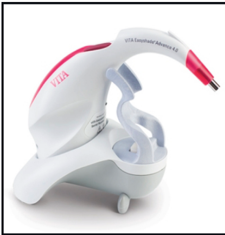
FIGURE 2: The VITA Easyshade Advance 4.0 spectrophotometer.

The sociodemographic information and the hygienic and dietary habits of the two groups are summarized in Table 1. No significant differences were found between the groups regarding tooth brushing, tobacco use, coloring drinks, and prior bleaching treatment. The two groups were pair-matched by age, gender, and socioeconomic level.