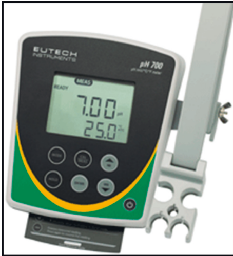
FIGURE 1: pH 700 meter.