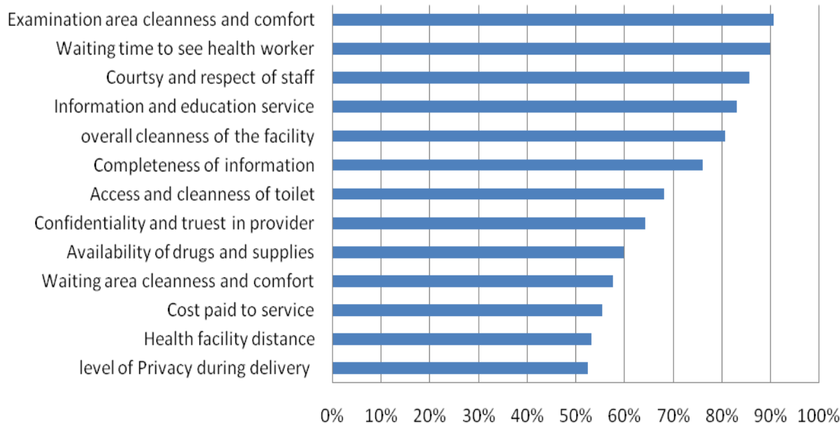
Figure 1 Major dimensions of care and average satisfaction scores by postnatal mothers delivered in 3 Referral hospitals in Amhara Region, Ethiopia.

In this study delivering mothers satisfactions was predicted by wanted status of the pregnancy, immediate