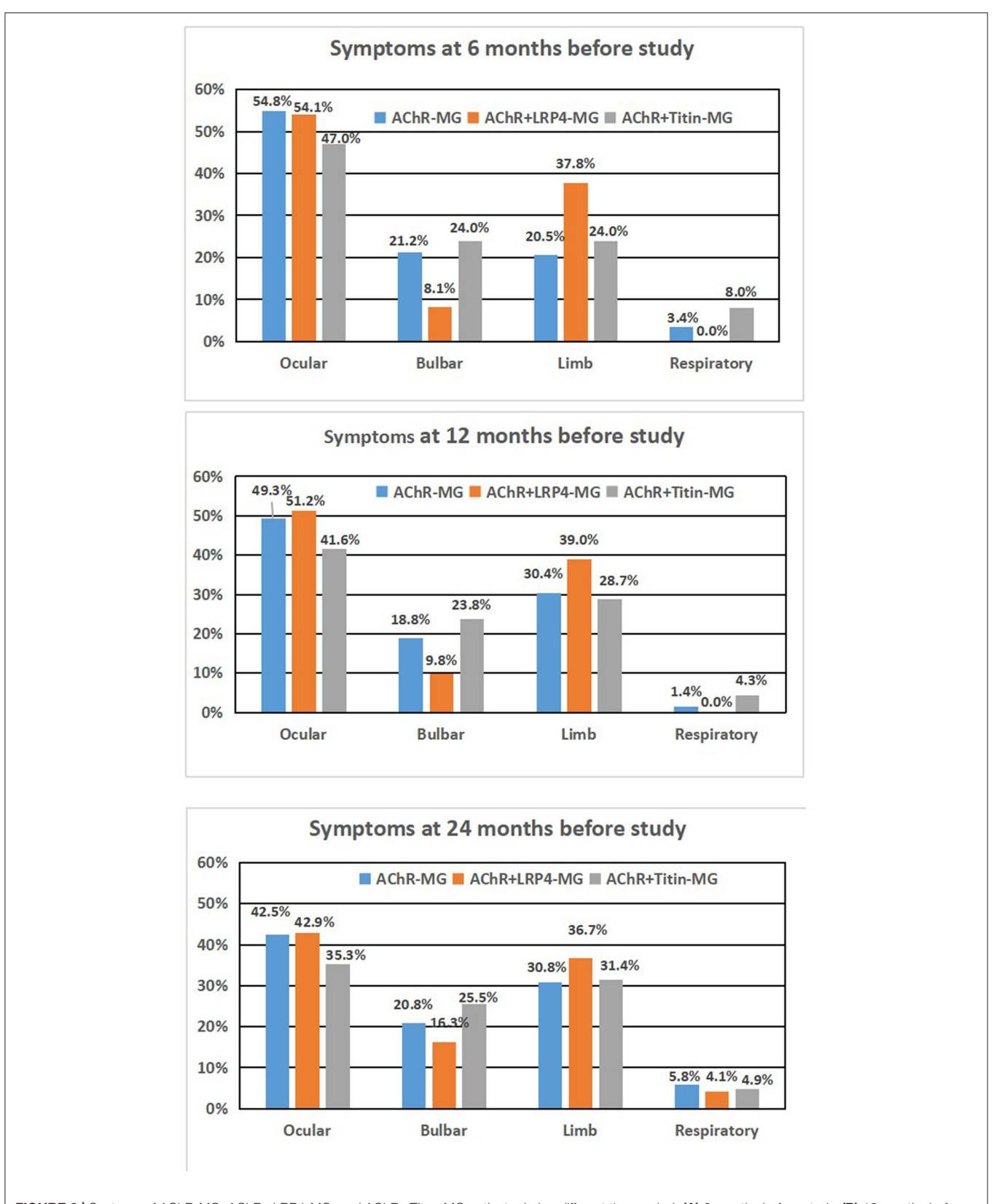
FIGURE 2 | Syptoms of AChR-MG, AChR+LRP4-MG, and AChR+Titan-MG patients during different time period. (A) 6 months before study, (B) 12 months before study, and (C) 24 months before study.