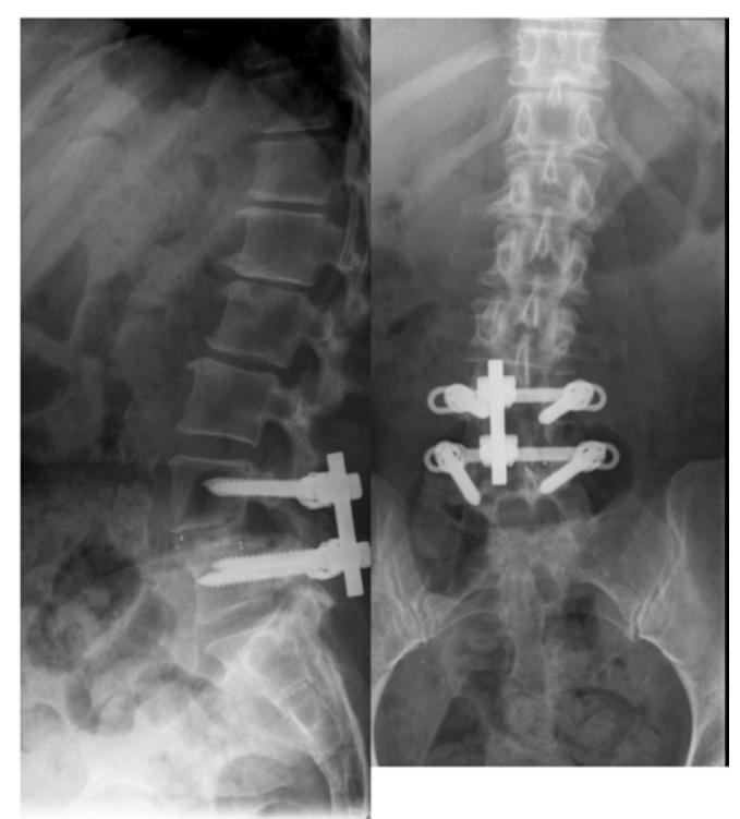
Fig. (3a). "Solid fusion" status (X-Ray).

insertion tool and occurred on impaction into the disc space. The 2 dural tears were repaired during surgery, there was no neurologic injury and the hospital course was not affected. None of the adverse events were related to the device under investigation (i.e. biocompatibility issues).