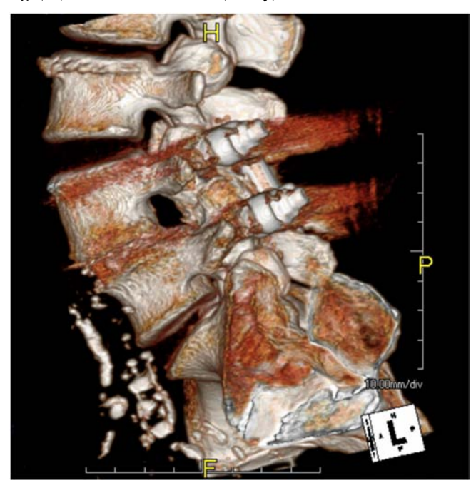
Fig. (3b). "Solid fusion" status (CT).