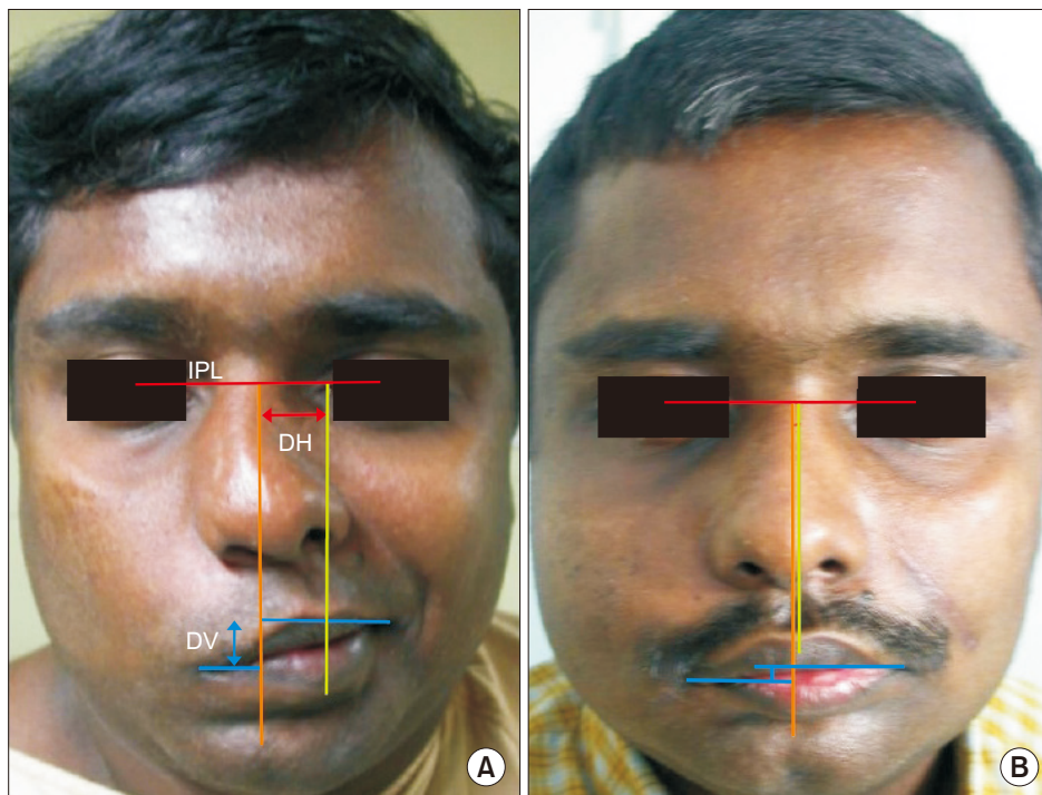
Fig. 1. Objective assessments of pre-operative (A) and postoperative (B) photographs. (IPL: inter pupillary line, DH: delta horizontal left right arrow, DV: delta vertical up down arrow) Krishnakumar Krishnan Santha et al: Dynamic smile reanimation in facial nerve palsy. J Korean Assoc Oral Maxillofac Surg 2020

After informed consent, the patient was counseled about realistic expectations and achievable goals. The surgery was done in a single stage. A parotidectomy incision (lazy S) with extension to the submandibular region was used to expose the paralyzed side of the face. The skin flap over the parotid-masseteric fascia was dissected until the orbicularis muscle of the lips on the affected site was visualized. Another incision was made on the normal side, 1 cm above and parallel to the nasolabial crease and facial nerve branches were identified. On stimulation, the branch which produced upward and