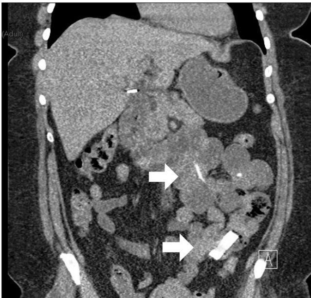
Fig. 1. Abdominal CT showing the intrajejunal location of the band. The superior arrow shows the connecting tube while the lower arrow shows the banding.