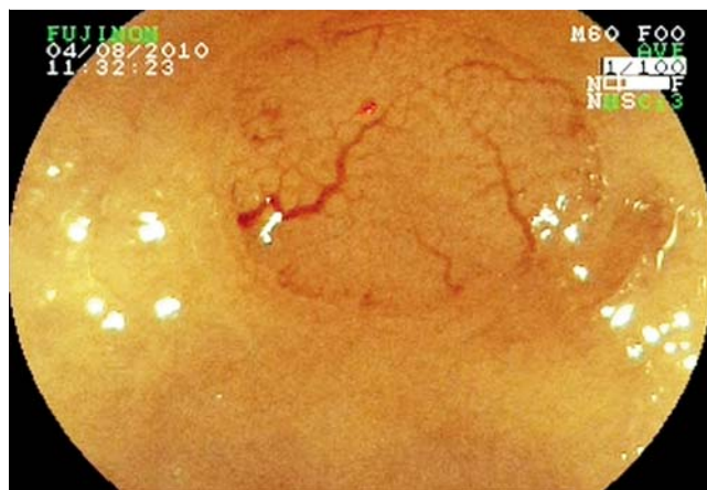
Fig. 1 Type II (Teixeira classification): Lesion with capillaries of a thicker diameter, curved, without dilatations. Hyperplastic polyp.

All lesions were diagnosed under white light, cleaned with tap water when necessary, and subsequently analyzed with a high resolution, magnification ( \times 60 – 100 ) colonoscope (Fujinon 590ZW5, Fujifilm Corp., Saitama, Japan), equipped with the EPX 4400 processor and FICE system, which enabled examination of wavelengths from 400 to 700 nm at 5-nm intervals. No chromoscopy with indigo carmine was performed before FICE. In this study, the following wavelengths were standardized: R550(2), G500(3) and B470(2), and used for real-time evaluation of the capillary pattern. The analysis was based on the Teixeira classification [17], which has five subtypes: type I is the normal pattern, with thin capillary vessels with a linear shape; type IIa presents hypovascularity or some capillaries of a thicker diameter, curved or straight but uniform, without dilatations (Fig. 1); type III exhibits numerous capillaries of thinner diameter, irregular and tortuous, with frequent point dilatations, and tapering like a spir-