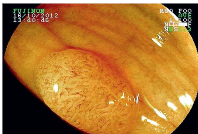
Fig. 2 Type III (Teixeira classification): Lesion showing several fine and irregularly distributed tortuous capillaries, with some points of dilatation, and tapering like a spiral shape. Tubular adenoma.

al shape, showing a remarkable periglandular arrangement (Fig. 2); type IVa presents numerous long, spiral, or straight vessels with a thicker diameter, and sparse dilatations, surrounding the villous glands (Fig. 3); type V shows pleomorphism of capillaries and abnormal distribution and arrangement (Fig. 4). All lesions were removed endoscopically with biopsy forceps, by snare polypectomy, or by endoscopic mucosal resection. Specimens were fixed in 10% formalin and subsequently examined using hematoxylin and eosin staining by two pathologists, who were blinded to the endoscopic results and who followed the guidelines of the World Health Organization classification of colorectal tumors [18]. In the case of multiple lesions in the same patient, each lesion was identified individually and placed in different flasks.