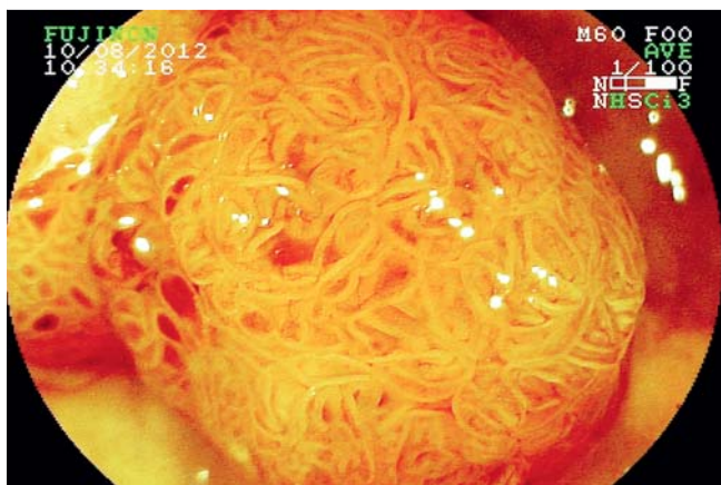
Fig. 3 Type IV (Teixeira classification): Lesion showing numerous, elongated, and spiral-shaped capillaries around villous glands. Tubulovillous adenoma.