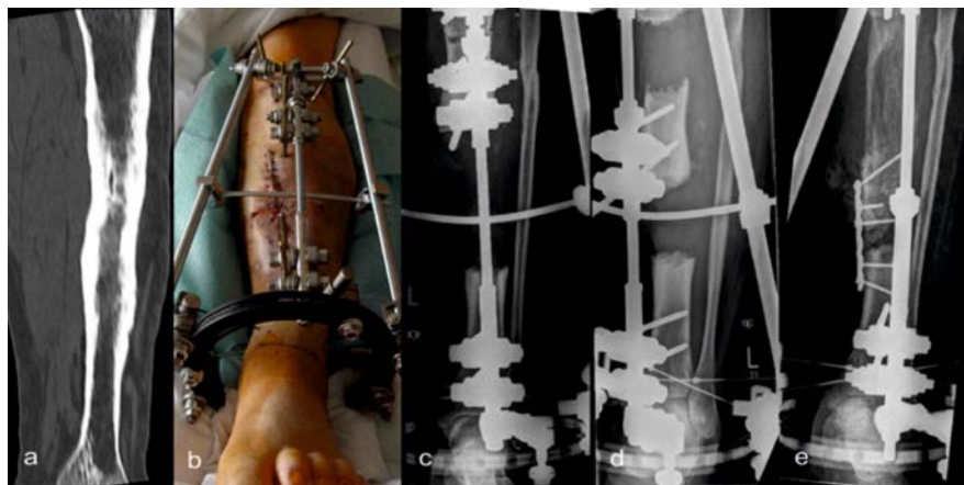
Figure 2. A 50 year old patient with posttraumatic tibial shaft osteitis: a) computed tomography findings before segment resection; b) Hybrid fixator after segment resection; c) proximal tibia corticotomy; d) on-going segment transport; e) diaphyseal docking via plate osteosynthesis and bone graft.