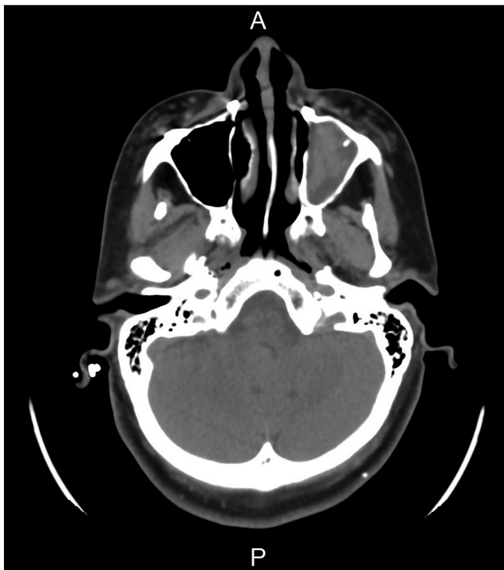
Fig. 2. Axial CT image of the skull showing complete opacification with hyperdense fluid content of the left maxillary sinus.

not initiate any treatment for her. However, tooth pain continued with severe headache that was not controlled neither by over the counter medications nor by controlled drugs. Therefore, Root Canal Treatment (RCT) was performed for tooth #24; however, the pain persisted so she was given steroids by the endodontist, although the pain subsided for one day; however, it returned and was continuous for another two weeks. The severity of the headache increased and persisted for 21 days. Then she went to the ER clinics in our institute, where a second CT was taken by the on-call neurologist that showed complete opacification with hyperdense fluid content of the left maxillary sinus (Figs. 1 and 2). However, both orbits appear symmetrical, with no definite abnormality on the left side. Both sinuses were blocked, but the left was completely obliterated. Accordingly, the on-call neurologist consulted the on-call ENT specialist, where both diagnosed the situation as Silent Sinus Syndrome SSS. Accordingly, the treatment of choice was Functional endoscopic sinus surgery (FESS), which was done to her under general anesthesia by ENT specialist in January 2019. Post-Operative instructions were given, which included; 2 weeks sick leave, no nasal trauma, regular diet, no heavy activity, and a follow up visit after seven days in the clinic. the medications: zinnat 500 mg tab