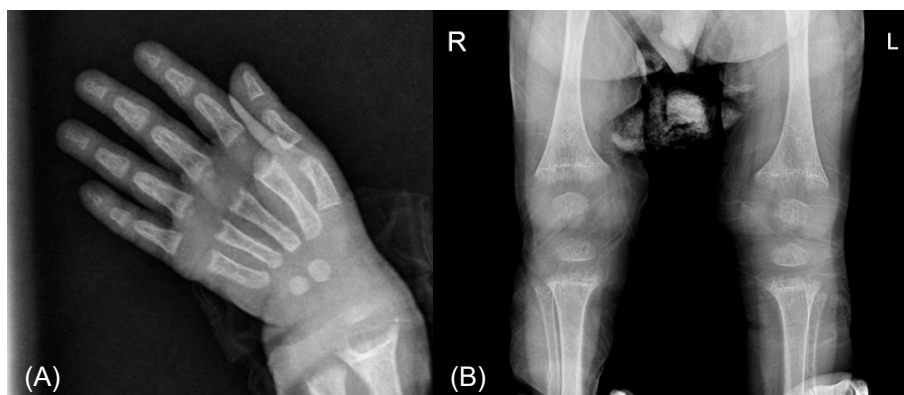
Fig. 1. Radiological findings. Simple radiography shows fraying and cupping of the metaphyseal regions of the radius and ulna (A), tibia and fibula (B). R, right; L, left.

SDS, standard deviation score; ALP, alkaline phosphatase; PTH, parathyroid hormone; Urine Ca/Cr, urine calcium/creatinine; 25(OH)D 3 , 25-hydroxyvitamin D 3 ; 1,25(OH) 2 D 3 , 1,25-dihydroxyvitamin D 3 .