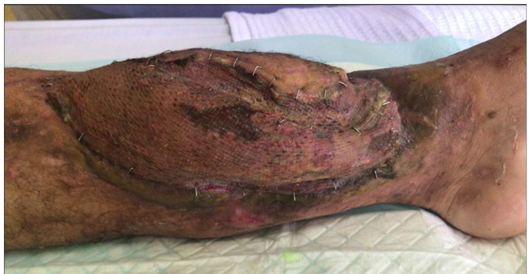
FIGURE 3: Good survival of vascularized osteomyocutaneous fibula flap at sixth week post-operatively.