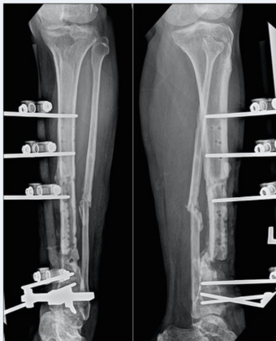
FIGURE 1: Radiographs showed non-union fracture distal third left tibia with chronic osteomyelitis and lucency around pin tracts.

Radiographic findings showed a non-union fracture distal third left tibia with features of chronic osteomyelitis such as sequestrum and involucrum (Figure 1). Bone lucency around Schanz pins indicates an osteolysis as a result of infection. Computed tomography angiography was done and showed normal vascularity of the left lower limb with no evidence of stenosis. Removal of the external fixator and thorough wound debridement were carried out to remove unhealthy soft tissue, necrotized bone and biofilm. Wound was then irrigated with copious amount of normal saline. Multiple tissue and bone samples were taken from infected site for culture and sensitivity. The patient was then put on an above-knee full-length Plaster of Paris (POP) for stabilisation. Culture-directed antibiotic was commenced and given for six weeks duration.