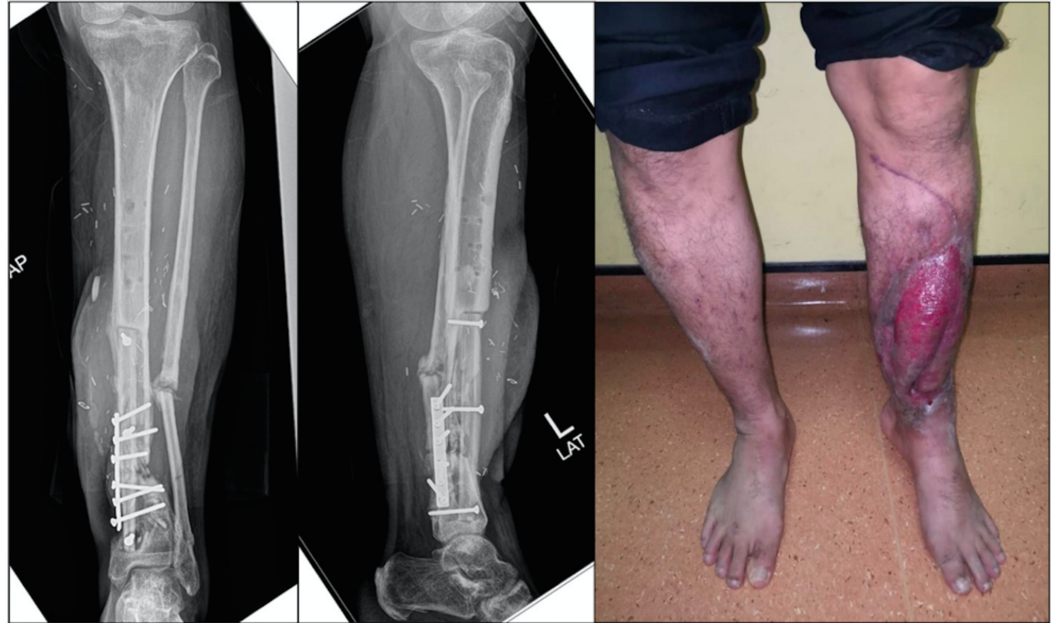
FIGURE 4: Radiographs at six months post-operatively showed viable vascularized fibula bone graft with callus formation around fracture sites. The patient is able to perform partial weight bearing ambulation with crutches.

At sixth month post-operatively, the patient was able to perform partial weight bearing ambulation with crutches. Radiographs showed viable vascularized fibular bone graft with callus formation around fracture sites (Figure 4). With this, we managed to salvage the limb and restored its functions.