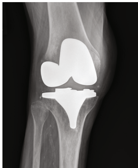
FIGURE 1: Anteroposterior radiograph of the right knee demonstrating TKA hardware without acute abnormality.

Crystal arthropathy due to either gout or pseudogout is rare in the setting of previous total joint arthroplasty. A review of the current literature reveals only 13 reported cases of pseudogout in prosthetic joints [12–21]. Although the majority of these cases were managed pharmacologically, 23% underwent surgical treatment consisting of washout alone or in addition to polyethylene exchange [22]. Periprosthetic