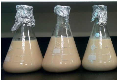
Fig. 1. Chicken viscera homogenate.

the best values found from the studied conditions were used as the constant values until each of all the parameters were studied at a time.