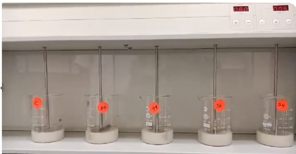
Fig. 2. Biofloculation test.

The flocculation efficiency of the biofloculant was estimated according to the techniques of Kurane et al. and Xiong et al. Briefly, 2 mL of crude biofloculant and 3 mL of 1% CaCl 2 were mixed with 100 mL of Kaolin clay solution (4 g/L) in 500 mL beaker and the pH adjusted to 7.0 ± 0.1. The beaker containing the mixture was mounted to a flocculator (JLT 6 Velp Scientifica, Italy) (Fig. 2) and stirred at 200 rpm for 1 min followed by 80 rpm for 5 min and finally held still for 5 min. The absorbance of the upper part of the mixture and the control (where 2 mL sterile medium was used in place of the