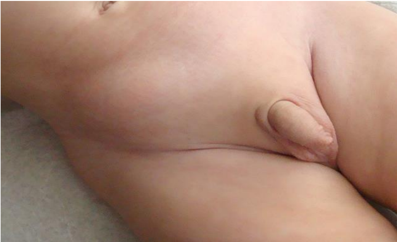
Figure 1: right inguinal bulging: the mass increased in size in moments of increased abdominal pressure especially when crying and seemed to move upwards towards the right abdominal area