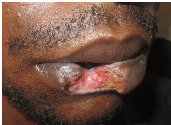
Figure 1 Clinical image: A human bite injury. Notice the severe lip tissue defect mimicking an ulcerative chronic process.