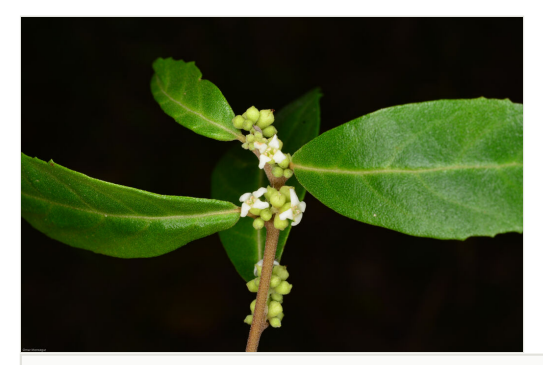
Figure 3. doi Flowering branch of Varronia bellonis collected along the Rio Grande in Sabana Grande Municipality, Puerto Rico.