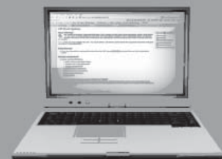
Table of contents Podcasts Ahead of Print Medscape CME Specialized topics