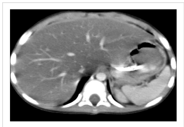
Fig. 1. Abdominal computed tomography showed a hepatomegaly and hepatosteatosis.