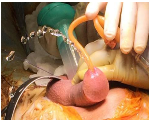
Figure 3 Intra operative irrigation revealing corpora-urethral fistula.