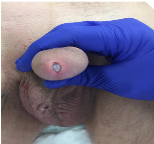
Figure 2 Extrusion of right cylinder following traumatic catheterization.