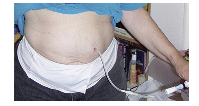
Fig 2. Functioning peritoneal dialysis catheter. This is the configuration of a functioning peritoneal dialysis catheter.

successful initial catheter use, need for catheter revision, development of peritonitis, and catheter survival.