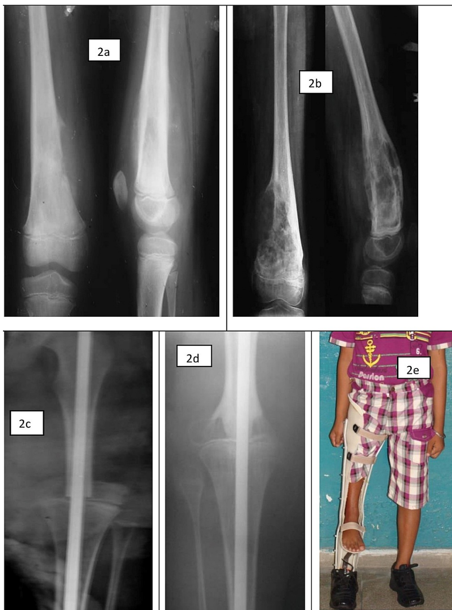
FIGURE 2: A 12-year-old boy with a diagnosis of osteosarcoma of the distal thigh

was 174.33 minutes (range 135 to 240 minutes) with an average blood loss of 600 ml (range 500 to 800 ml). They were ambulated with a customized extension prosthesis assembled in the institute, without any external walking aid. A young patient having Ewing sarcoma of the distal thigh managed with straightplasty and rehabilitated adequately with prosthesis has been shown in Figure 2.