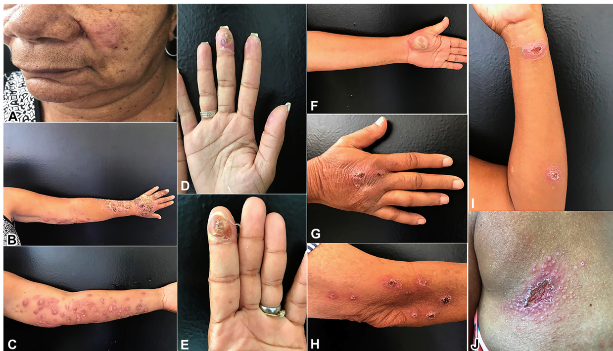
Fig 1. Disseminated sporotrichosis lesions. A , B , and C , Patient 1 with lesions on the face and right upper aspect of her arm. D and E , Patient 2 with lesions on the fingertips of the hands. F , G , and H , Patient 3 with lesions on the hands, right arm, and elbow. I and J , Patient 4 with lesions on the upper portion of the body and left forearm.

during 28 days), with visible improvement. The patient was then discharged with itraconazole 400 mg/d. One month later, she presented with new lesions on the left forearm and gastrointestinal complaints (epigastric pain and diarrhea). Potassium iodide 3.5 g/d was started and the patient continued to receive a dose of itraconazole 200 mg/d. She continued this regimen for 22 weeks, by which time the lesions had entirely resolved.