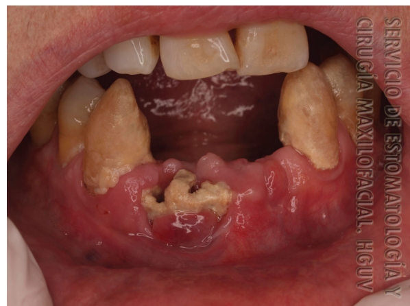
Fig. 1: Osteonecrosis due to denosumab in the jaw in case 2.

Regarding the clinical aspect, we considered the location of the ONJ (upper jaw, jaw or both), the number of exposures, the maximum size of the exposures, the presence of pain, infection, suppuration, intraoral fistula, extraoral fistula and bone exposure (Fig. 1). Finally, we classified the 15 cases in the stages proposed by Ruggiero et al. (3).