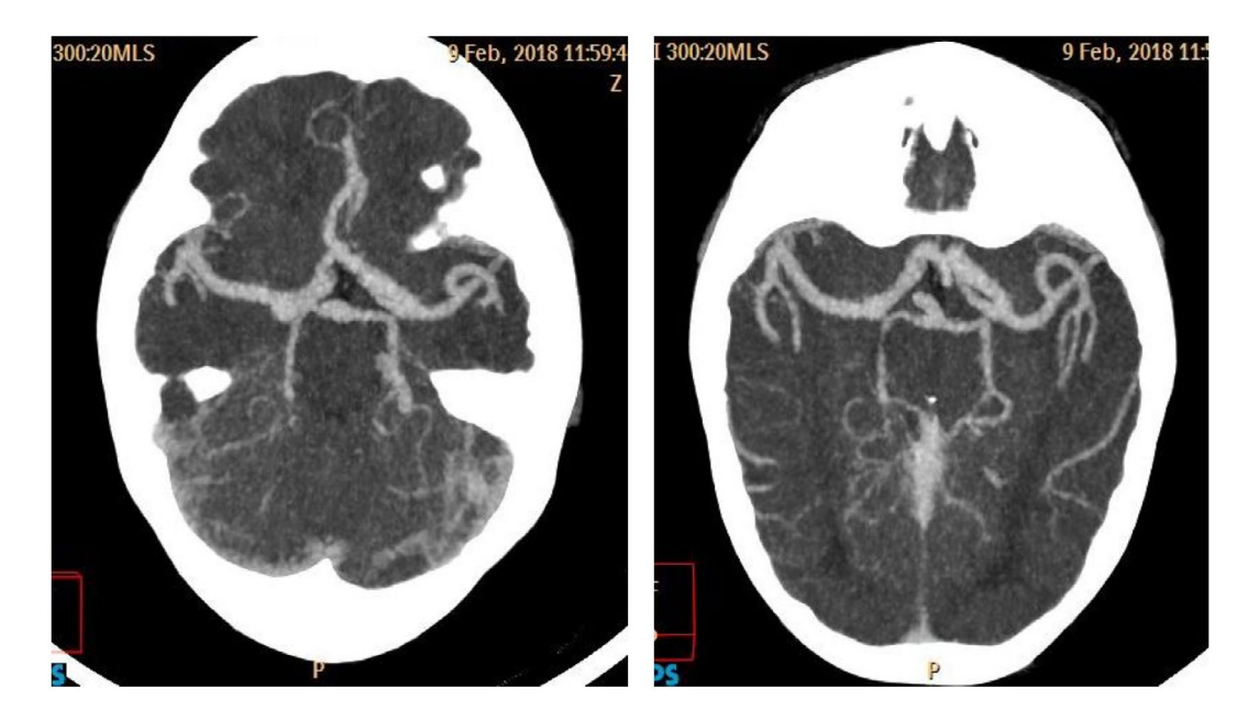
FIGURE 2 Computed tomography scan of brain showing giant circle of Willis

FIGURE 1 Computed tomography scan of chest showing substantial aortic root dilatation (white arrows), (a) pre-contrast administration; (b) post-contrast administration