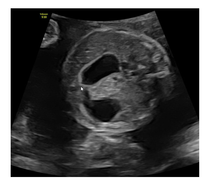
FIGURE 3 Ultrasound image of the duodenal atresia (double bubble) observed in case 2