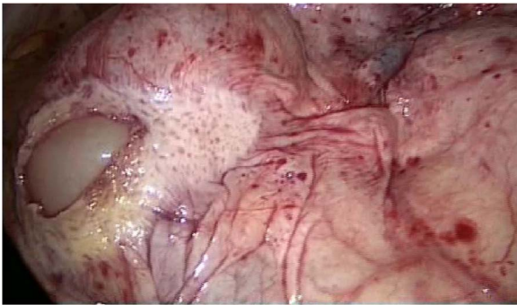
Figure 2: Dorsal peritoneum covering the entire ileum.