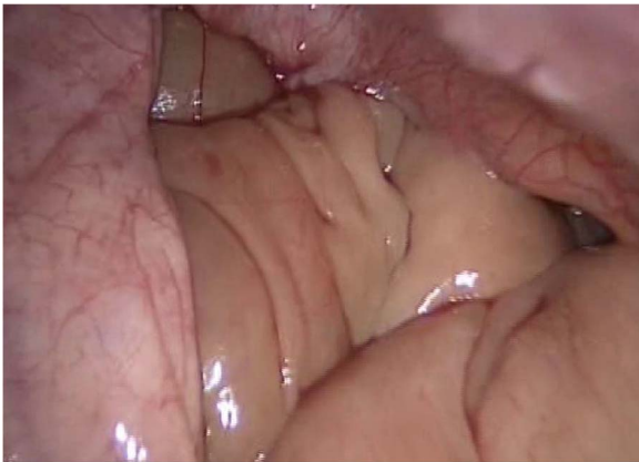
Figure 3: Retroperitoneal view, showing the ileum.

endoscopic ink-marked region were visualized perfectly. While getting an overview of the abdominal cavity, we noticed an abnormality in the ileum region. It seemed that the peritoneum was covering the entire ileum. The situs is depicted in Figs 1–4.