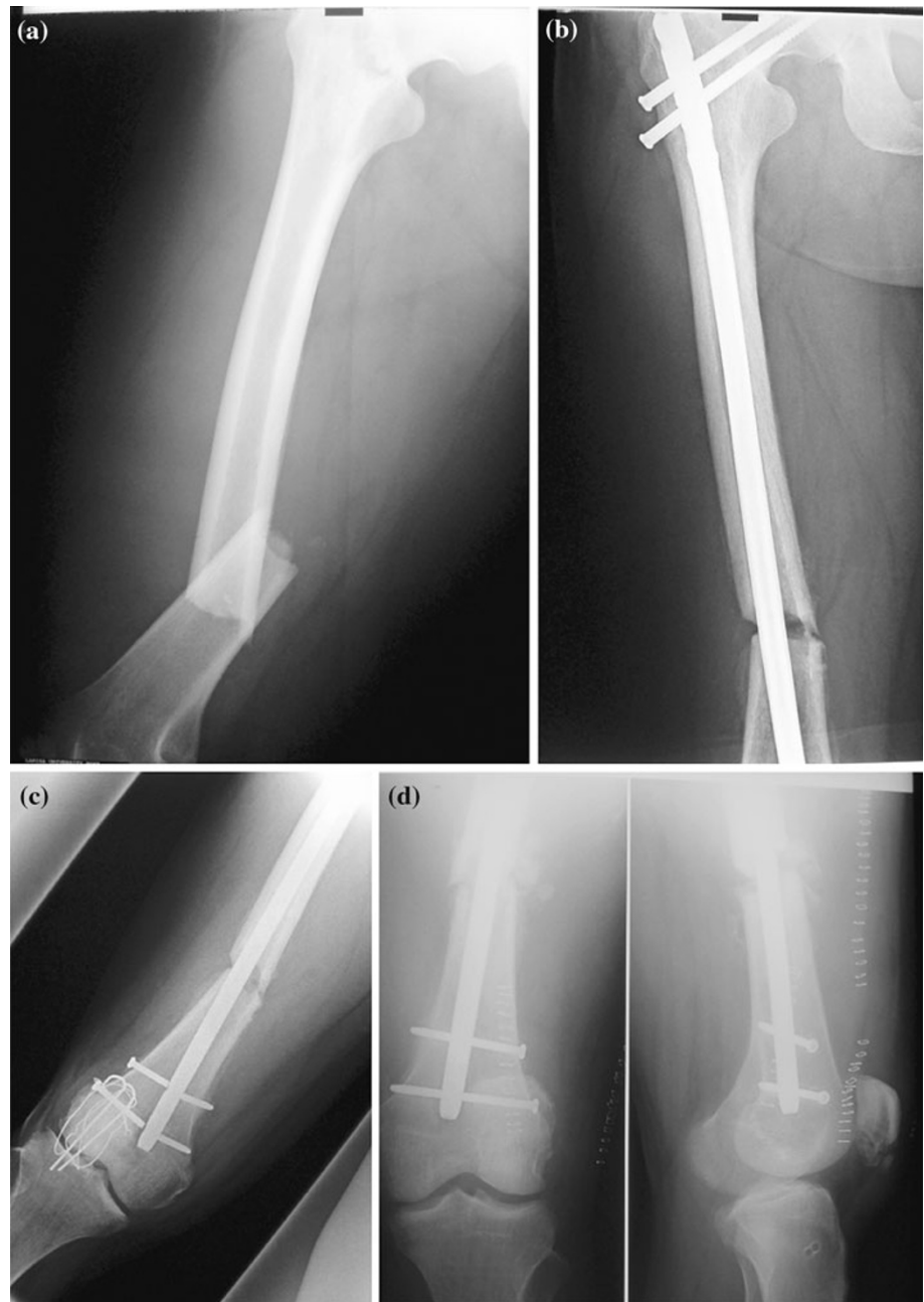
Fig. 2 Radiographs of patient no 9: a pre-injury, b and c 5 months post-surgery. Valgus displacement had occurred as a result of distal screw breakage, d broken screws were replaced, and bone graft was inserted at the diaphyseal fracture site. IF hardware was also removed from the patella

comminuted shaft fractures. Problems associated with alternative fixation methods, such as knee pain and stiffness from retrograde nailing or extensive dissection and stress shielding for plate fixation, are avoided with reconstruction nailing. The success rate of this procedure has been reported to range between 69 and 100% [10, 11, 15]. However, several disadvantages have been reported. This procedure is technically demanding. Nail insertion may cause further displacement of an undisplaced or minimally displaced femoral neck fracture, which then may be difficult to reduce. Importantly, difficulties have been reported in obtaining rotational alignment of the fractures as well as