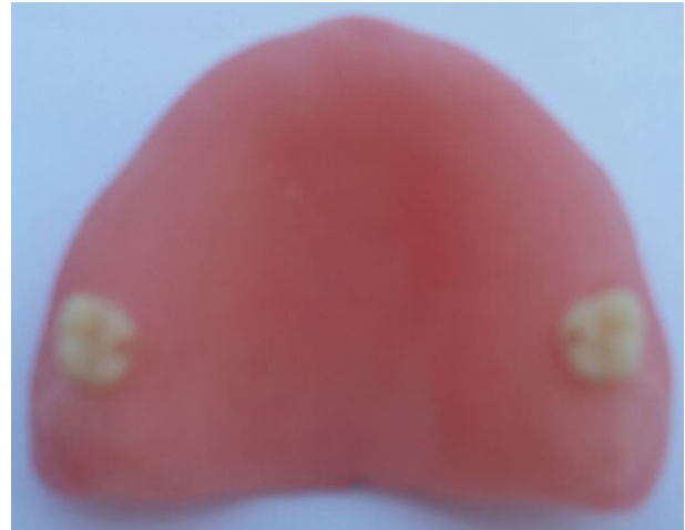
Fig. 2 Reference points for molar-molar measurements

The lengths between A, B, C and D points were standardized in all dentures by using metallic bar. The distances between these points in the fitting surface were measured by dial caliper (Mitutoyo, Us Ms00 13,