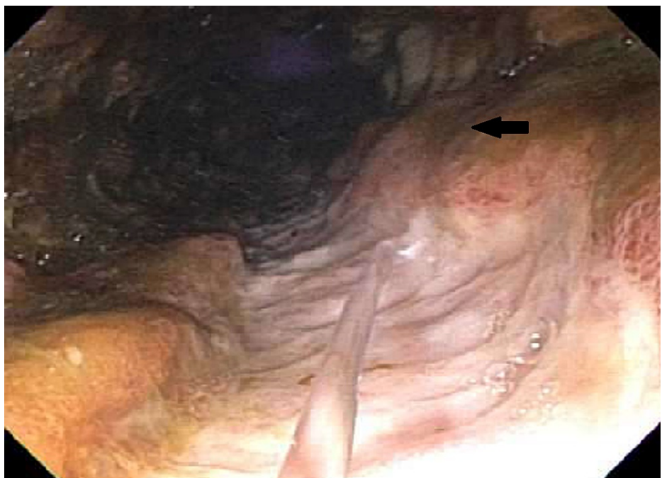
FIGURE 3: Large ulcer in descending colon (arrow)

The findings include ulcers larger than 2 cm, greater than 30% ulcerated surfaces, with more than 75% of surfaces affected