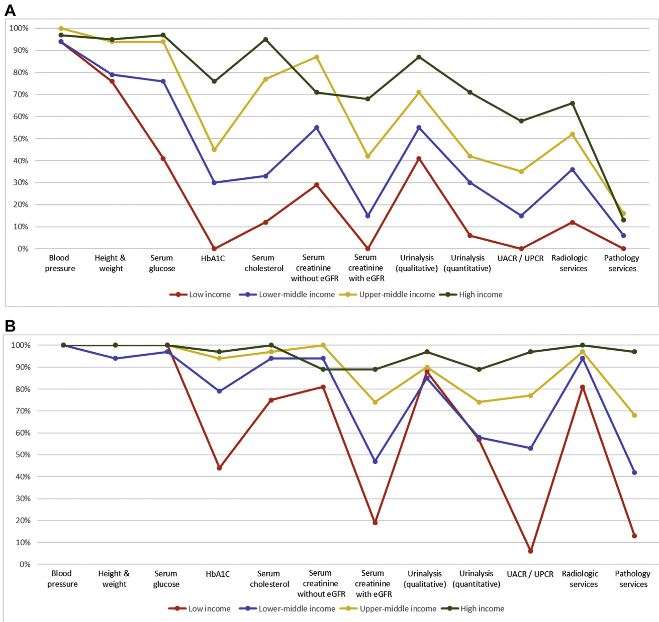
Figure 1. Health care services for identification and management of chronic kidney disease by country income level. (A) Primary care (ie, basic health facilities at community levels [eg, clinics, dispensaries, and small local hospitals]). (B) Secondary/specialty care (ie, health facilities at a level higher than primary care [eg, clinics, hospitals, and academic centers]). Abbreviations: eGFR, estimated glomerular filtration rate; HbA1C, glycated hemoglobin; UACR, urine albumin-to-creatinine ratio; UPCR, urine protein-to-creatinine ratio. Data from Bello et al 4 and Htay et al. 42

health care system is structured. The density statistic merely represents the number of nephrologists per million population and provides no indication of the adequacy to meet the needs of the population or quality of care, which depends on volume of patients with kidney disease and other workforce support (eg, availability of multidisciplinary teams).