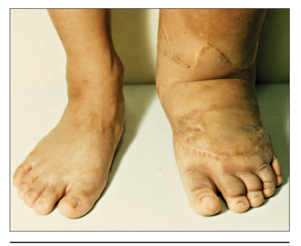
Figure 1 Patient's legs at 20 years old. The left leg is edematous, and two operations to remove fibromatous tissue had been performed. The patient used bandages for edema all the time. At the first visit, the left leg was bandaged, and the patient said the leg's condition was the same as in this picture.

A 38-year-old woman visited the clinic of the Center for Kampo Medicine at Keio University Hospital, Tokyo, Japan, for refractory diarrhea. She had left leg lymphedema since birth, for which she was diagnosed with Milroy's disease. According to the International Society of Lymphology (ISL) staging system (Table 1),1 lymphedema was classified as late stage 2 because of chronic edema of the left leg and clearly organized fibrosis. Even though Milroy's disease is known to be a hereditary disorder, this patient did not have a family history of lymphedema. As in a previously reported case, she had been experiencing coldness and occasional abdominal pain without any other symptoms since she was 20 years old. She had undergone plastic surgery to remove fibromatous tissue from her legs twice when she was child. She had been using a compression bandage for the edema in the left leg (Figure 1). When she was 35 years old, she moved to Manila, where she was exposed to significant temperature variations between the cold temperature in an air-conditioned room and the hot temperature outside. Even though the weather outside was hot and humid, she contracted a severe cold and experienced frequent episodes of lower abdominal pain and watery diarrhea (more than six times a day). There was no fever or tenesmus. The abdominal pain